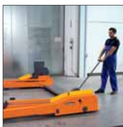
Easily manoeuvrable by one person