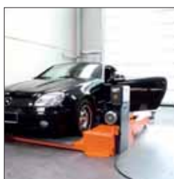
Free access, doors can be opened, no columns