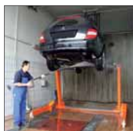
Use for washing