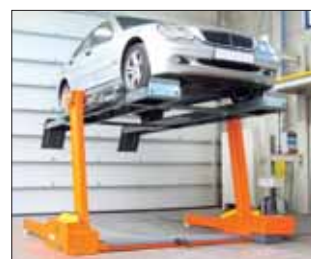
Accessory: Runways, capacity 2.75 t,