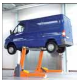
Version FHB3000-SL suitable also for vans